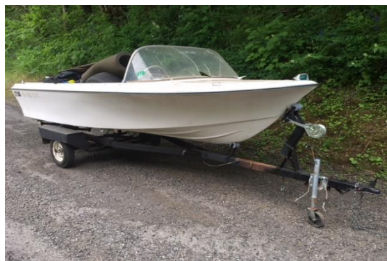
Top Left Photo- A young man admitted to driving too fast on NE Mershon just prior to hitting another motorist. This pictured Subaru had its rear wheel torn from the axle and airbags were deployed. Left Bottom- This boat, filled with garbage, was dumped in the middle of Clara Smith Rd.. This is one of 2 boats and several vehicles that have been recently abandoned. Top Right- Citizen Patrol volunteers had an enjoyable spring dinner at Menucha.