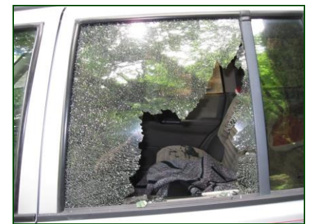
Information provided by the Citizen Patrol volunteers. www.mcsocp.com